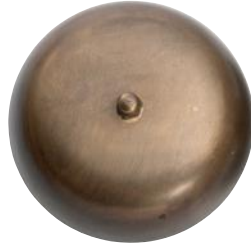
5515 AB D90mm