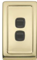
5803 72 x 115mm