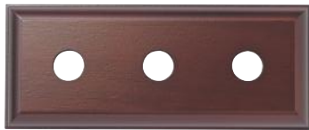
5433 225 x 90mm