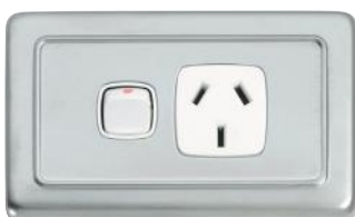
5878 115 x 72mm