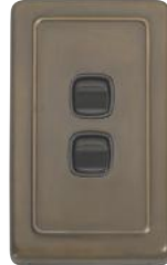
5843 72 x 115mm