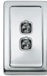
5943 72 x 115mm