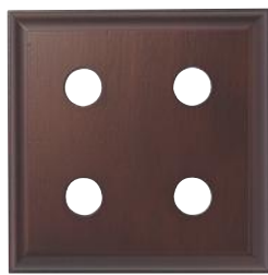
5435 155 x 155mm