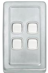
5875 72 x 115mm