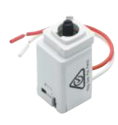
5456 Dimmer 5457 Fan Controller