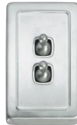
5973 72 x 115mm