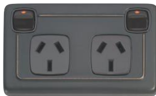
5819 115 x 72mm