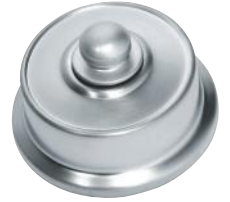
5531 Dimmer SC 5532 Fan Controller SC