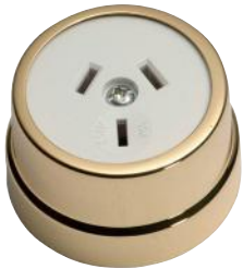
5479 PB/Brown 5480 PB/White