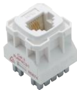
5447 Telephone/White 5446 Telephone/Black

Standard switch mechanisms supplied are 10 AMP - 2 way, 15, 20 and 35 AMP mechanisms are available (rocker only). 3 way intermediate rocker switches are available (to suit flat plate ranges only).