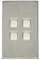
5985 72 x 115mm