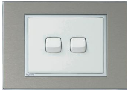
8862 SS/WH 8872 SS/GR