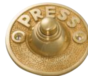
5503 PB 63mm