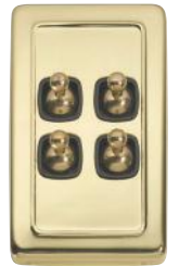
5905 72 x 115mm