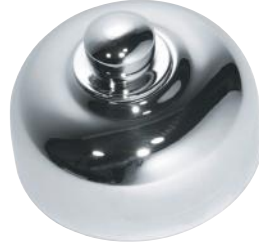
5775 Dimmer CP 5795 Fan Controller CP