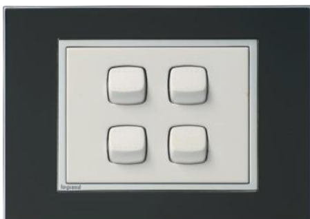
8824 BL/WH 8834 BL/GR