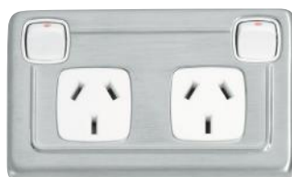
5879 115 x 72mm