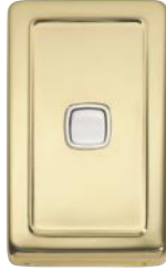
5852 72 x 115mm