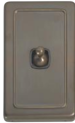
5892 72 x 115mm