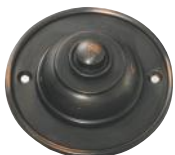
5510 AC 75mm