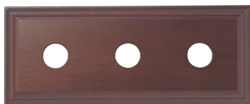
5413 225 x 90mm