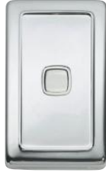
5882 72 x 115mm