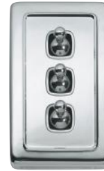
5944 72 x 115mm