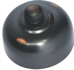
5675 Dimmer AC 5695 Fan Controller AC