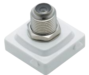
5025 Pay TV