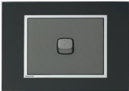
8821 BL/WH 8831 BL/GR