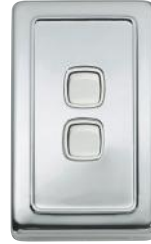
5883 72 x 115mm