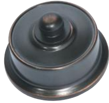
5473 Dimmer AC 5493 Fan Controller AC