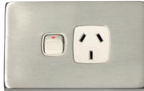
5988 115 x 72mm