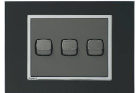
8823 BL/WH 8833 BL/GR