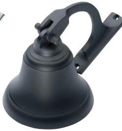
1295 MB D100mm