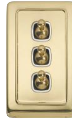
5954 72 x 115mm