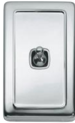
5942 72 x 115mm