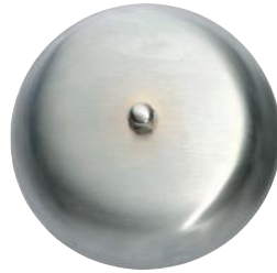
5518 SC D90mm