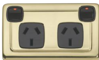
5809 115 x 72mm