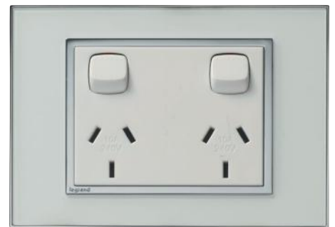
8800 WH/WH 8810 WH/GR