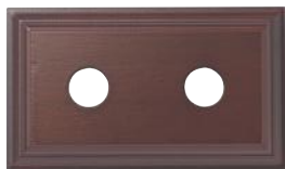
5412 155 x 90mm