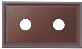
5432 155 x 90mm