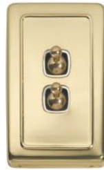
5953 72 x 115mm