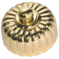
5483 Dimmer PB 5487 Fan Controller PB