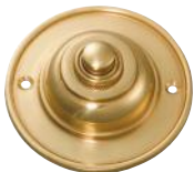
5500 PB 75mm