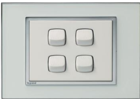
8804 WH/WH 8814 WH/GR