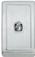
5972 72 x 115mm