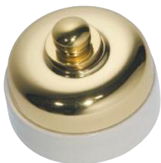
5101 Dimmer PB/IV 5102 Fan Controller PB/IV