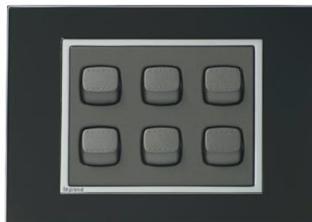
8825 BL/WH 5 Gang 8835 BL/GR 5 Gang