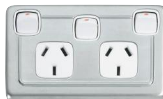
5877 115 x 72mm