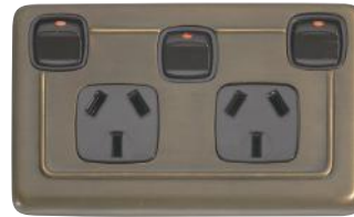
5847 115 x 72mm