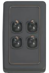
5915 72 x 115mm