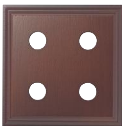
5415 155 x 155mm