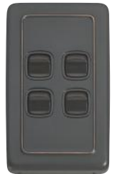
5815 72 x 115mm