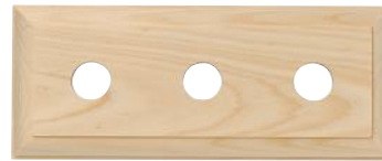
5443 225 x 90mm