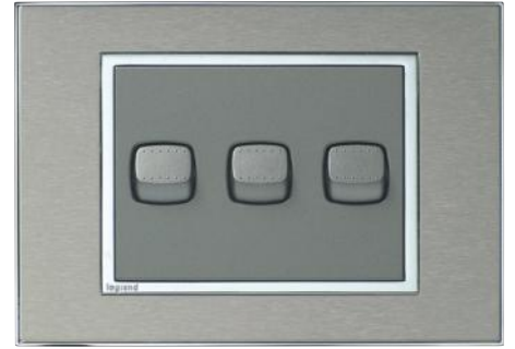
8863 SS/WH 8873 SS/GR