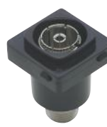
5022 Digital TV/Brown 5023 Digital TV/White