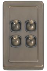
5895 72 x 115mm