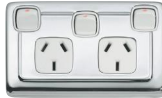
5887 115 x 72mm