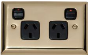
5459 PB/Brown 140 x 90mm