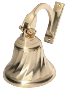
1292 PB D100mm