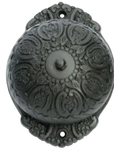
5509 AF 125 x 92mm/73 x 42mm