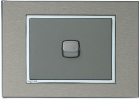
8861 SS/WH 8871 SS/GR