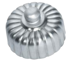
5541 Dimmer SC 5542 Fan Controller SC