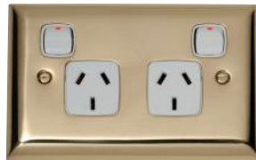
5469 PB/White 140 x 90mm