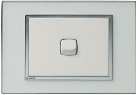
8801 WH/WH 8811 WH/GR