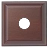
5431 90 x 90mm