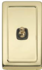
5902 72 x 115mm