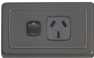
5818 115 x 72mm