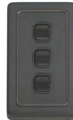
5814 72 x 115mm