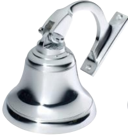
1293 CP D100mm