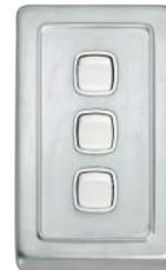
5874 72 x 115mm