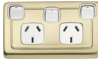
5857 115 x 72mm