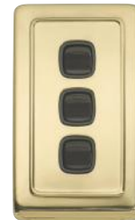
5804 72 x 115mm