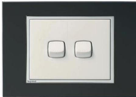
8822 BL/WH 8832 BL/GR