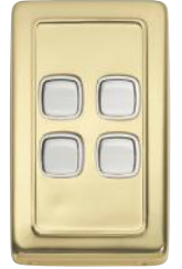
5855 72 x 115mm