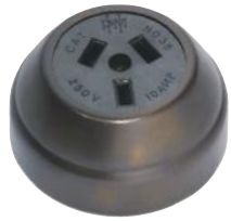
5564 AB/Black 5565 AB/White