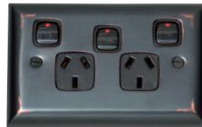
5689 AC/Brown 140 x 90mm