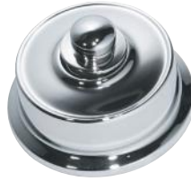
5772 Dimmer CP 5792 Fan Controller CP