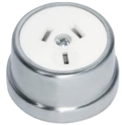
5524 SC/Brown 5525 SC/White