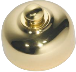
5475 Dimmer PB 5495 Fan Controller PB