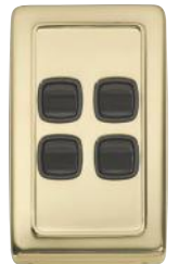
5805 72 x 115mm