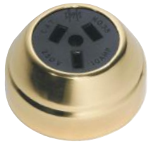
5476 PB/Black 5478 PB/White