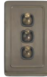
5894 72 x 115mm