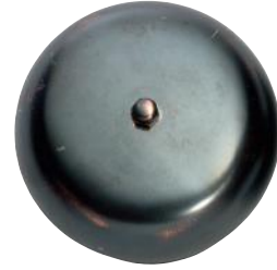
5516 AC D90mm