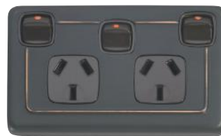
5817 115 x 72mm