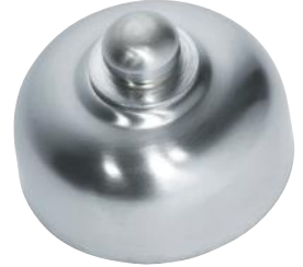
5521 Dimmer SC 5522 Fan Controller SC