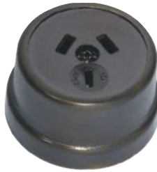
5554 AB/Brown 5555 AB/White