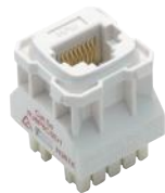
5021 Data/White 5020 Data/Brown