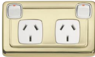
5859 115 x 72mm