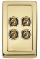
5955 72 x 115mm