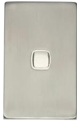
5982 72 x 115mm