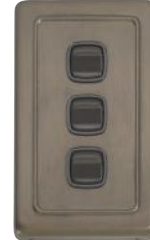
5844 72 x 115mm