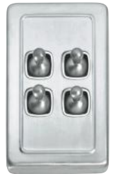
5975 72 x 115mm