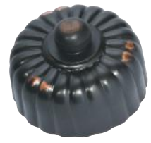
5484 Dimmer AC 5488 Fan Controller AC