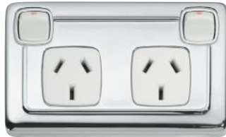
5889 115 x 72mm