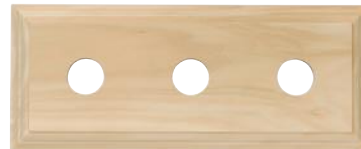
5423 225 x 90mm