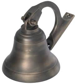
2369 AB D100mm