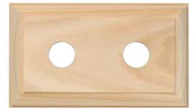
5442 155 x 90mm