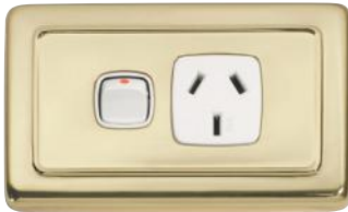
5858 115 x 72mm