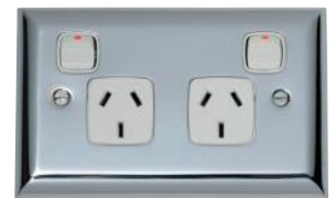
5769 CP/White 140 x 90mm