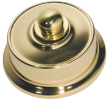
5472 Dimmer PB 5492 Fan Controller PB