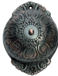
5508 AC 125 x 92mm/73 x 42mm