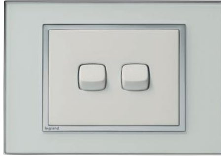
8802 WH/WH 8812 WH/GR