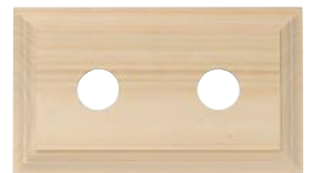
5422 155 x 90mm