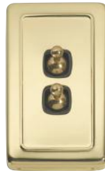
5903 72 x 115mm