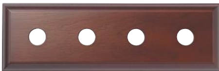
5434 280 x 90mm