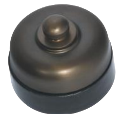
5156 Dimmer AB/BL 5157 Fan Controller AB/BL

Switches are 10 AMP - 2 way, Dimmers and fan controllers are variable speed and require a switch to turn on & off. Dimmers are 400VA, suitable for most applications including low voltage downlights and incandescent lights. Not suitable for LED.