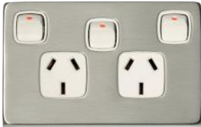
5987 115 x 72mm