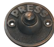
5513 AC 63mm