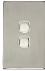
5983 72 x 115mm