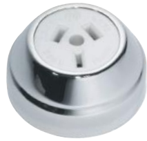
5776 CP/Black 5778 CP/White