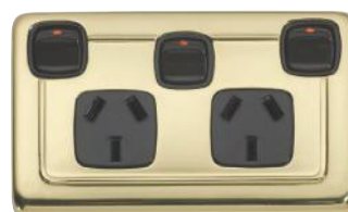
5807 115 x 72mm