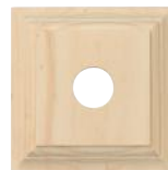
5421 90 x 90mm