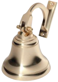
1290 PB D100mm