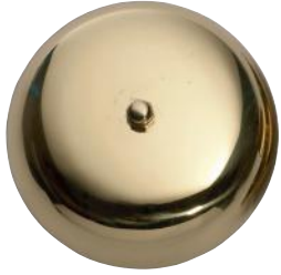
5514 PB D90mm