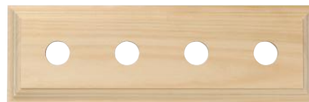
5424 280 x 90mm