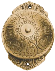
5504 PB 125 x 92mm/73 x 42mm