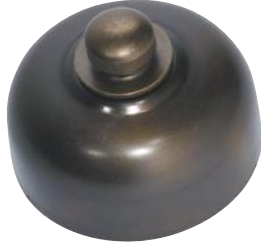
5551 Dimmer AB 5552 Fan Controller AB