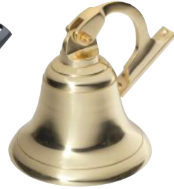
1291 PB D125mm