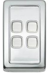
5885 72 x 115mm