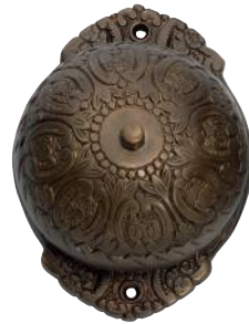
5507 AB 125 x 92mm/73 x 42mm