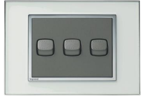
8803 WH/WH 8813 WH/GR