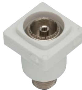
5023 Digital TV