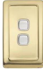
5853 72 x 115mm