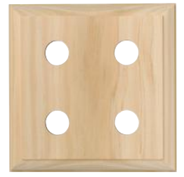
5445 155 x 155mm