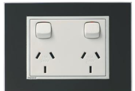
8820 BL/WH 8830 BL/GR