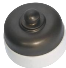
5106 Dimmer AB/IV 5107 Fan Controller AB/IV