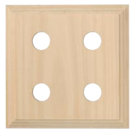
5425 155 x 155mm