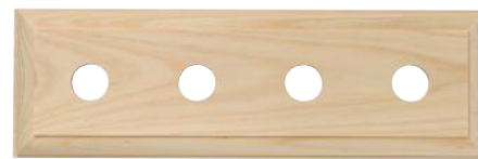
5444 280 x 90mm