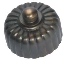
5571 Dimmer AB 5572 Fan Controller AB