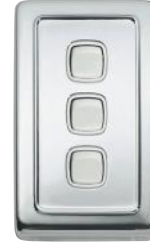
5884 72 x 115mm