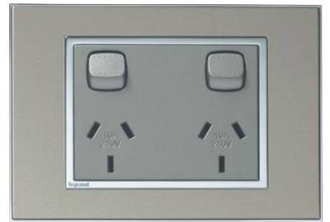
8860 SS/WH 8870 SS/GR