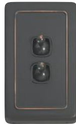
5913 72 x 115mm