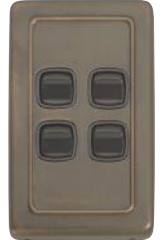
5845 72 x 115mm