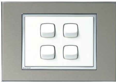
8864 SS/WH 8874 SS/GR