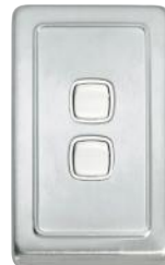
5873 72 x 115mm