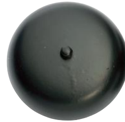
5519 MB D90mm