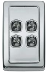
5945 72 x 115mm