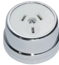
5779 CP/Brown 5780 CP/White