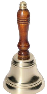
1294 PB D75mm H160mm