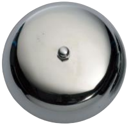
5517 CP D90mm