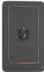
5912 72 x 115mm