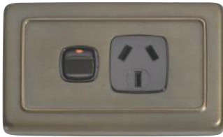
5848 115 x 72mm