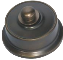
5561 Dimmer AB 5562 Fan Controller AB