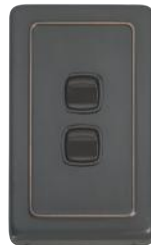
5813 72 x 115mm