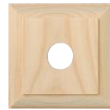
5441 90 x 90mm