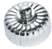
5783 Dimmer CP 5787 Fan Controller CP