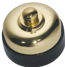
5151 Dimmer PB/BL 5152 Fan Controller PB/BL