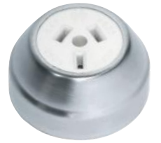
5534 SC/Black 5535 SC/White