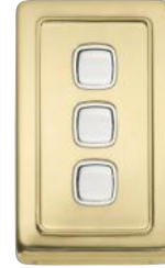
5854 72 x 115mm