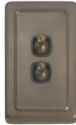
5893 72 x 115mm