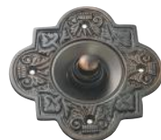
5512 AC 90 x 90mm