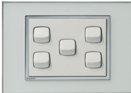
8805 WH/WH 5 Gang 8815 WH/GR 5 Gang