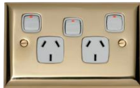
5499 PB/White 140 x 90mm