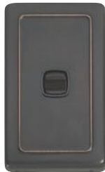
5812 72 x 115mm