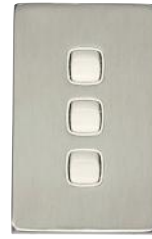
5984 72 x 115mm