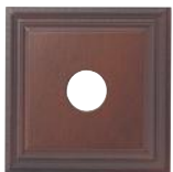
5411 90 x 90mm

Polished blocks are 'Cedar' stain applied to MDF veneer