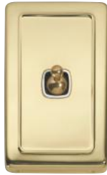
5952 72 x 115mm