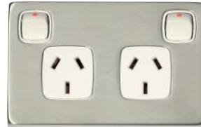
5989 115 x 72mm