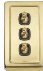
5904 72 x 115mm