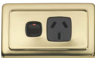
5808 115 x 72mm