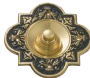
5502 PB 90 x 90mm