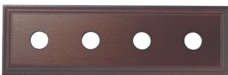
5414 280 x 90mm