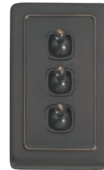
5914 72 x 115mm