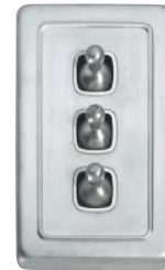
5974 72 x 115mm