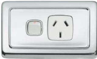
5888 115 x 72mm