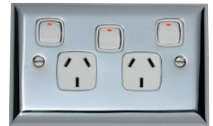
5799 CP/White 140 x 90mm