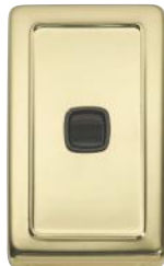
5802 72 x 115mm