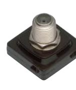
5024 Pay TV/Brown 5025 Pay TV/White