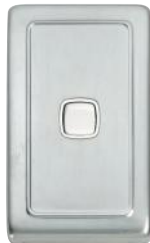
5872 72 x 115mm