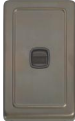
5842 72 x 115mm