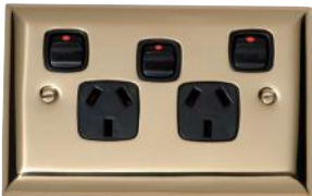
5489 PB/Brown 140 x 90mm