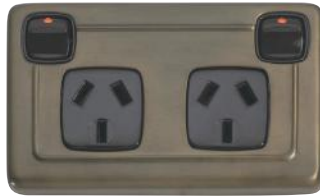
5849 115 x 72mm