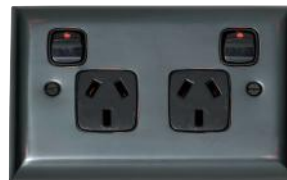
5659 AC/Brown 140 x 90mm